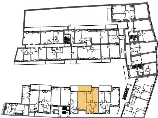
ÜBERSICHT OG 1