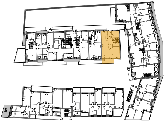
ÜBERSICHT OG 2